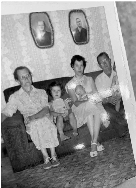
August, 1954 Alvaton, Kentucky

Here is a link to the 2021 IDoP: https://www.un.org/en/observances/international-day-peace